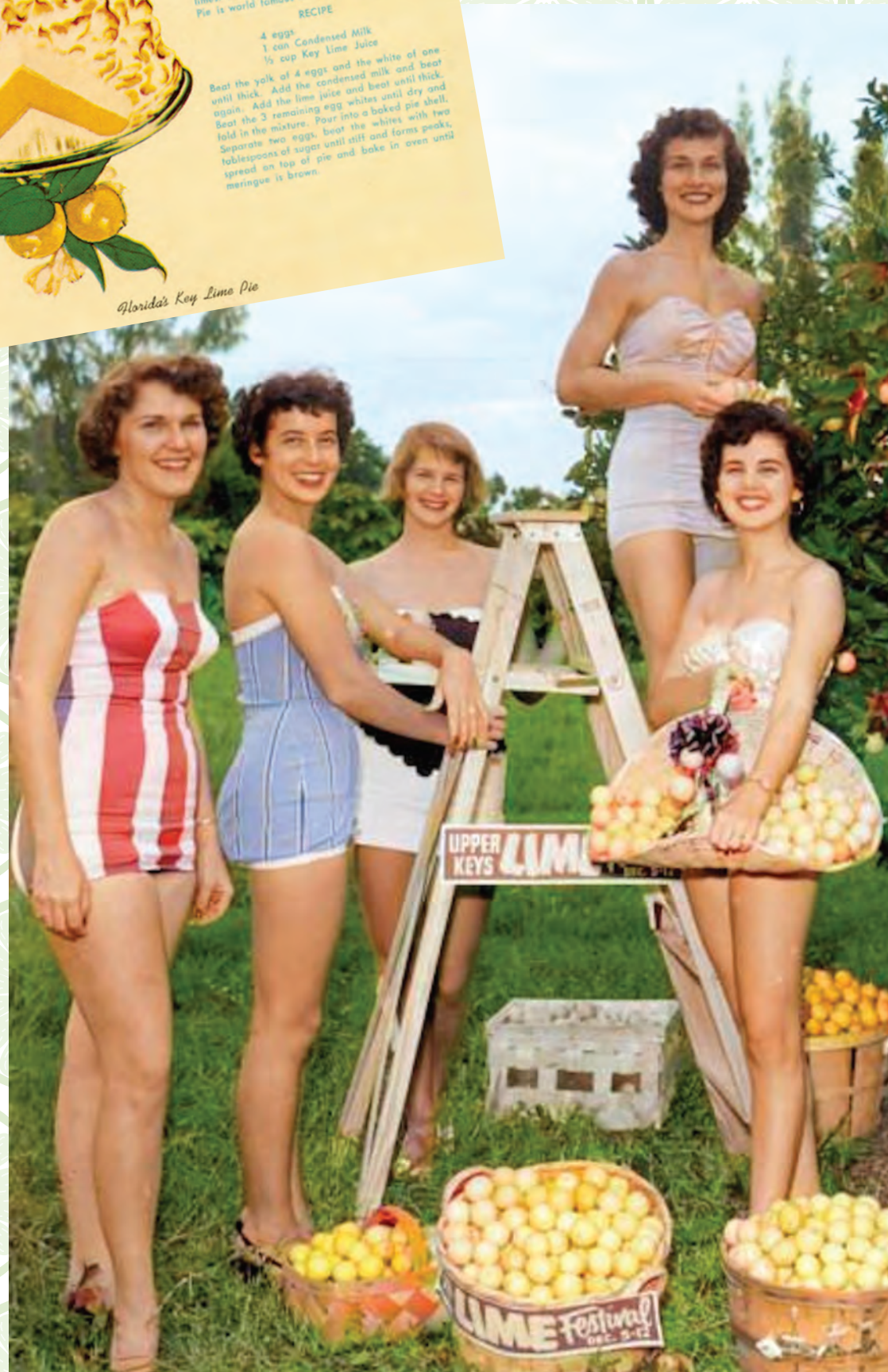
Lime graphic courtesy of pony/Shutterstock.