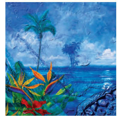
"Paradise 88" by Dayton Claudio