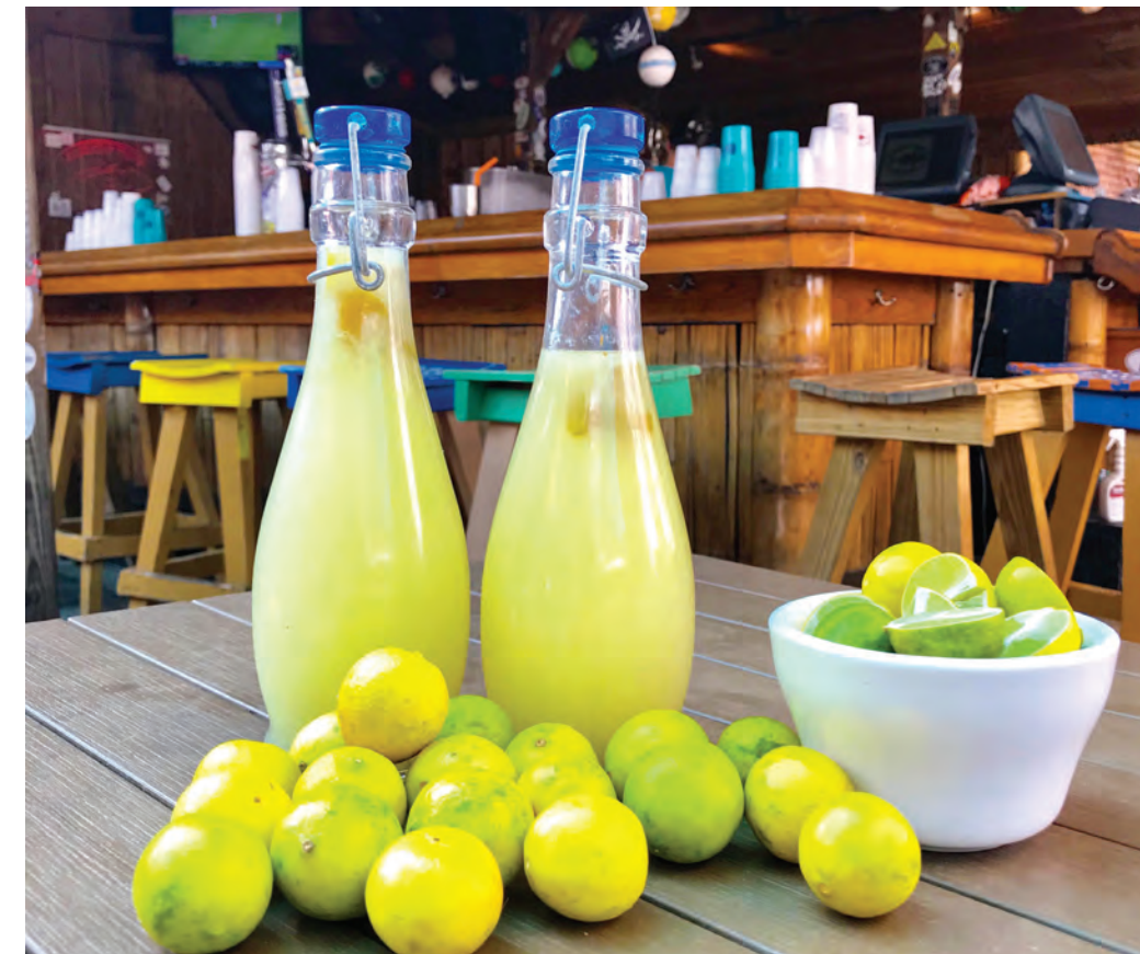
Juice from tart Key limes is liquid gold in the Florida Keys.