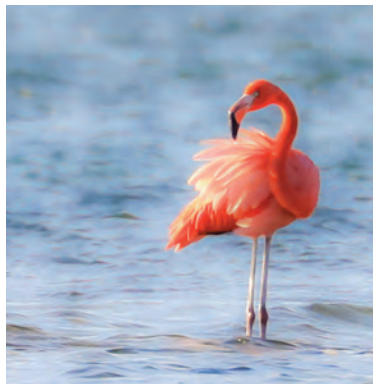
"Wild Keys Flamingo" by Valerie Preziosi