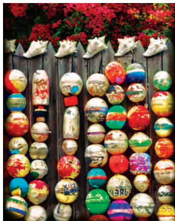
"Lobster Trap Buoys" by CJ Groth

December 2 CITY OF KEY WEST HOLIDAY PARADE 7 p.m. Starts at Truman Ave. and White St. cityofkeywest-fl.gov