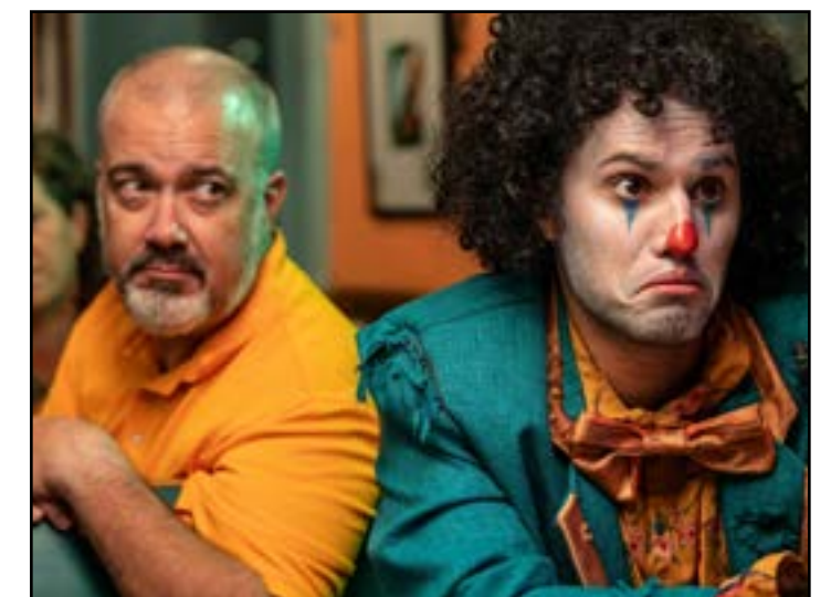
Grant funds supported local cast members appearing in the film.

We produced a short film, "Party Time," utilizing local talent and diverse locations throughout Monroe County. This project brought together actors and crew members from the area, showcasing the region's potential as a backdrop for cinematic storytelling. Filming across multiple Monroe County sites allowed us to highlight its unique landscapes and architectural features, enhancing the visual appeal of our film. This approach not only supported the local creative economy by employing area professionals but also promoted Monroe County as a versatile and attractive filming destination. Grant funds supported local cast members appearing in the film.