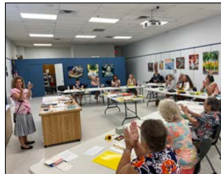
Afternoon art classes were joyful.

allowed the home bound community to enjoy the performance and with over 3,700 people watching on Facebook, illustrating the interest and need. Art, music and social interaction fulfills many needs: creativity, feeling of accomplishment, sharing ideas and dropping the burdens of the day for a moment - to name a few. Given the excitement at signup time, we really tapped into a need for the over 65 community for both men and women. We heard many words of appreciation. "I'm caring for my mother now and this was so nice to take time for me." "I've never tried this before - but I did well."