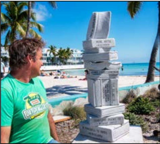
Heavy Reading by Craig Gray is part of the Sculpture on Loan, Art in Public Places Project. The sculpture was installed in Duval Street Pocket Park in early 2024.