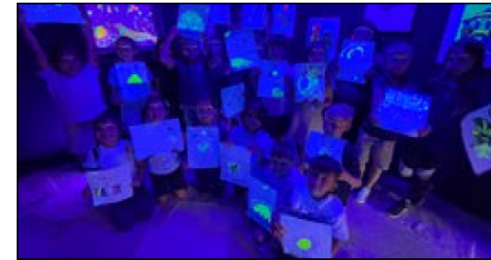
Wonderfully created arts projects glow!