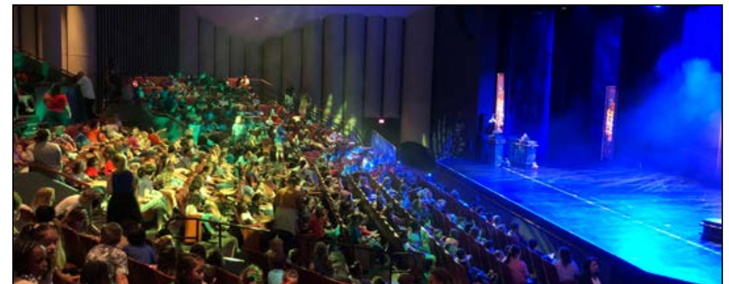
Tennessee Williams Theatre filled with students and support staff await the entertainment.