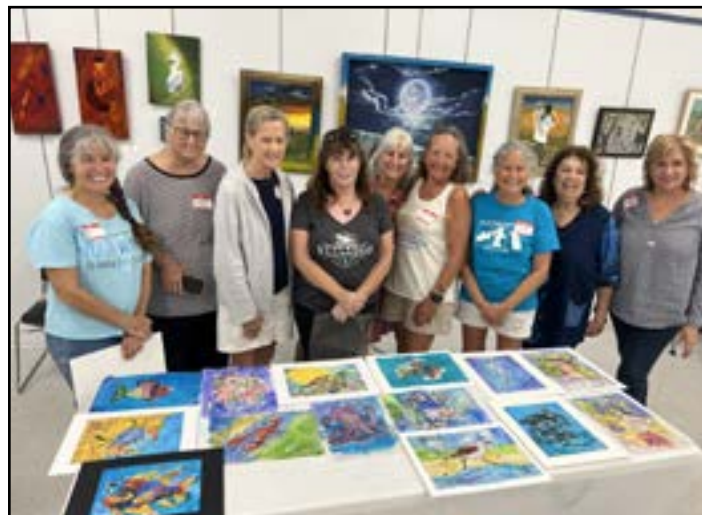
A well attended batik class in the community room.

AGPI and the Friends of the Key Largo Library provided high quality instruction to the community by tapping into the talented retired art teachers among the Guild membership. AGPI promoted the series of classes online and in meetings. Our Arts Council liaison attended each art class and some of the concerts to promote Arts Council. Many of the instructors helped with other classes. This built relationships with students and community members. Streaming the concerts