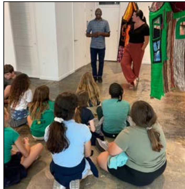
Students are engaged during learning at The Studios.