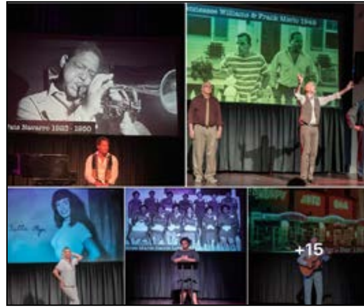
Talented actors bring unique characters to life.

The workshop series intertwined science with art using invasive lionfish jewelry making. Each workshop included educational and storytelling components that connected participants with the marine and cultural heritage of the Florida Keys, instilling and strengthening a sense of place. This project culminated with a one-day Arts & Science Festival, a free community event, that hosted booths from local artists and environmental organizations, each sharing a unique art or hands-on science activity. The project served Keys businesses whose employees are likely to identify as ALICE populations and whose business services are likely to serve ALICE populations. Much of the workforce of the Florida Keys maintains several jobs to make ends meet, and struggle to meet the rising costs of living. The project will support employees of businesses such as those who serve tourists, advocate for unhoused people and pets, provide