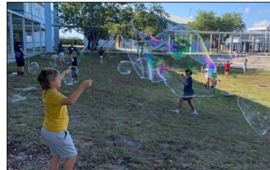
Sugarloaf School students are in love with this challenging and artistic science project.

The aim of this project was to expose students to the unique characteristics of bubbles, have them make their own bubble wands then use them to create the fleeting work of art in a big bubble. Sessions were held with each of the three fifth grade classes over the three-week