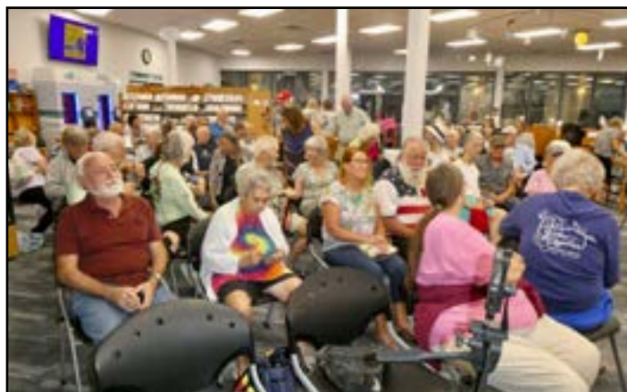
Friday night free music was appreciated by many senior citizens.