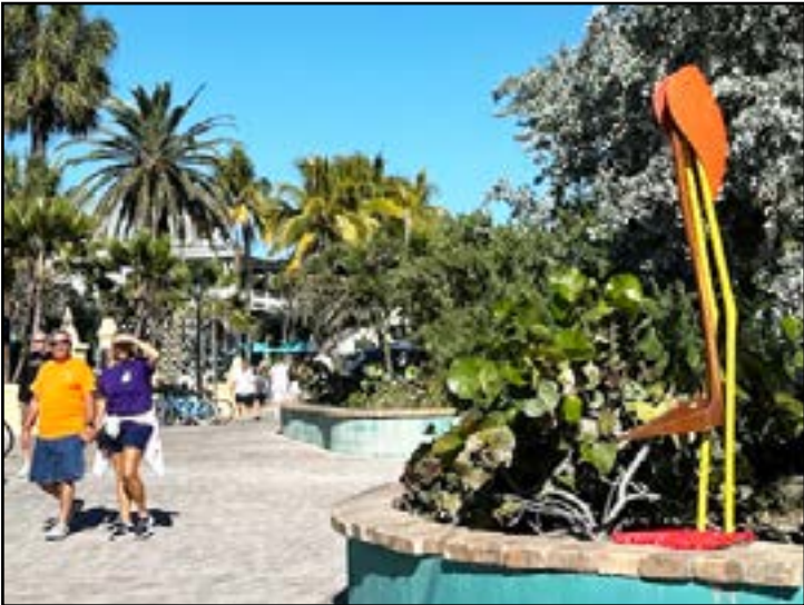
Key Heron by Tim Marshall Curtis on display at Duval Street Pocket Park. The sculpture is made of recycled captain's chair, flats guide push poll, salvaged wood from sailboat wreckage.