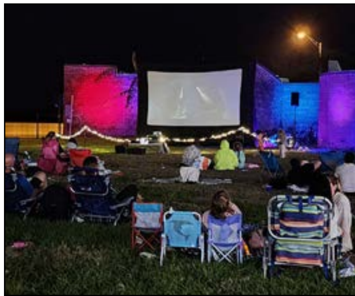
East Martello's new event space hosts outdoor movies.

The Outdoor Movie Series offers Key West citizens and our visitors a fantastic opportunity to enjoy movies in a safe and community-centric environment. This event is free to the public and is tobacco free, ensuring a family-friendly atmosphere. With entertainment suitable for all ages, even well-behaved pets are welcome to join in the fun. The screenings are on the first and third Friday of every month, starting on October 13 and running through May 17. Grant funds supported outreach and marketing.