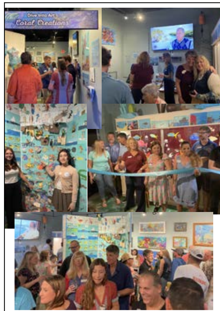
History of Diving Museum's outstanding art exhibitions.

HDM partnered with the AGPI, Monroe County School District (MDSC) and five coral restoration organizations throughout the Keys to develop a project bringing art, science and environmental awareness together. They created a featured exhibit that included student art, AGPI member art and educational materials from the organizations. The exhibit opened at HDM in January. AGPI members prepared a project outline with instructions and sent to schools for the start. Teachers indicated if they were able to participate with their classes and were offered a $150 budget and told how to request supplies. HDM, AGPI and volunteers installed all the pieces and hosted a ribbon cutting with 218 attending the celebration including students, their families, teachers, school administrators, and the Islamorada Chamber of Commerce. Another 6,876 visited the Museum exhibit before it closed.