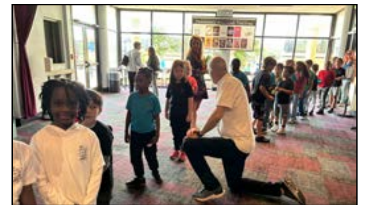
Elementary students enthusiastically enter the theatre lobby.