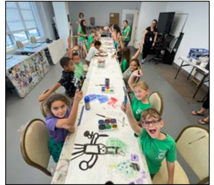
Students enjoy the field trip to the Studios of Key West for art classes.

span in April. The first week session with each class involved a discussion of the chemistry, physics and optics of big bubbles, as well as the variables such as polymers, detergent, wind, sun, dust, bugs and humidity. Students also de-cored the cotton rope in preparation for making the wands in week two. We ended the session with a big bubble demonstration in the courtyard. Week two involved the students, working in teams of two, each making their own bubble wand, using the de-cored cotton rope, 3'bamboo sticks and shrink tubing.