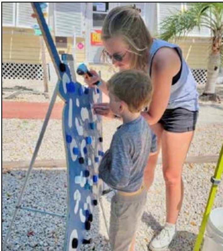
Hands on learning was the focus of REEF's Arts and Sciences series.

education programs, and support marine conservation in the Florida Keys. The Arts & Science Celebration Series is designed to reduce the challenges and income needed to participate in "extraneous activities." This project supported the workforce of the Florida Keys with programs and resources to connect with art and science to nourish their creative side.