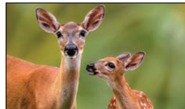
Key deer is an endangered subspecies of the white-tailed deer that lives only in the Florida Keys.

Kristie wrote and published a book about nature in the Florida Keys. It was a compilation of my photographs and journal writings documenting my experiences and stories over the past 10 years while working as a Park Ranger for the Florida Keys National Wildlife Refuges. Book length is 152 pages with over 70 stories of wildlife, plants, habitats, and landscapes. Stories include fun facts, where to find them, my own personal experiences and how you can help save the precious wildlife of the Keys.