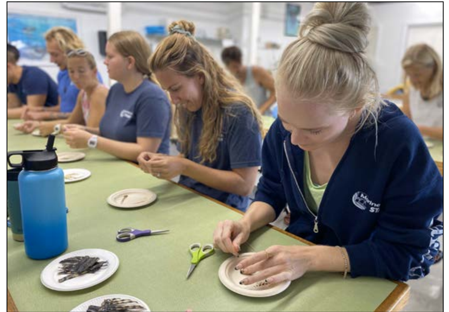
Upper Keys teens and families create lionfish jewelry during the REEF festival.

This project connected residents with the arts in the same way REEF's citizen science programs empower individuals to contribute to scientific research. Science is not just a thing that happens in a lab for people with PhDs; art is not just for creative people with expertise and lots of free time. The project showed participants that arts and science are all around us, easy to access, and fun to engage with.