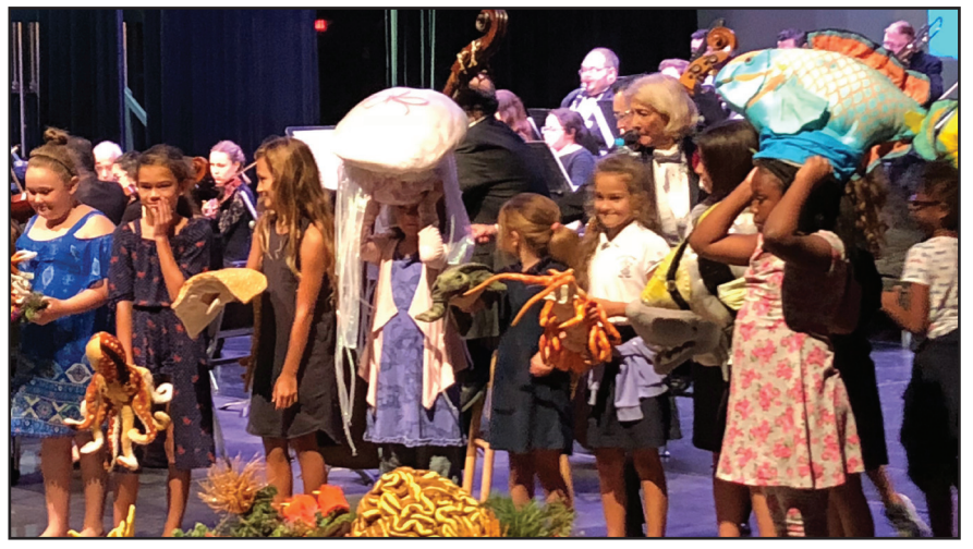
Monroe County elementary students participate onstage as underwater creatures to showcase teamwork and preservation.