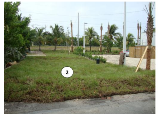
Facing US Highway 1