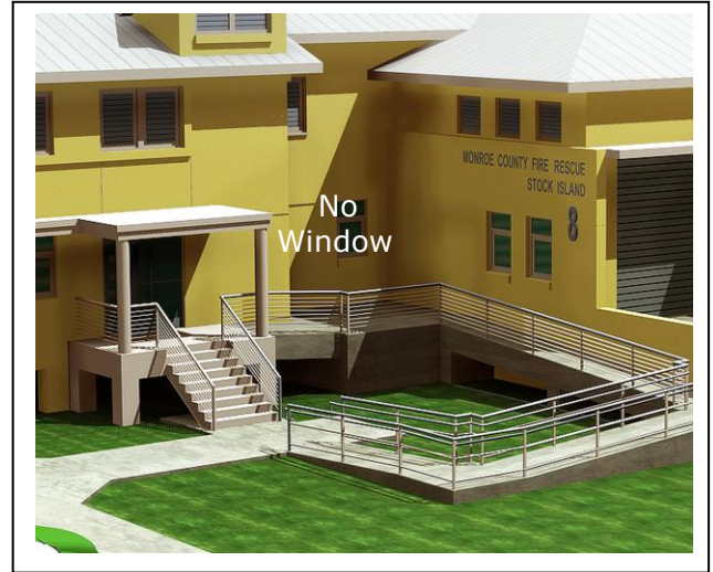
3-D Drawing indicates character of Targeted Spaces A. and B.