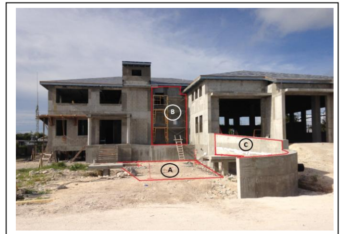
Site Under Construction Targeted Spaces A., B., C. Indicated